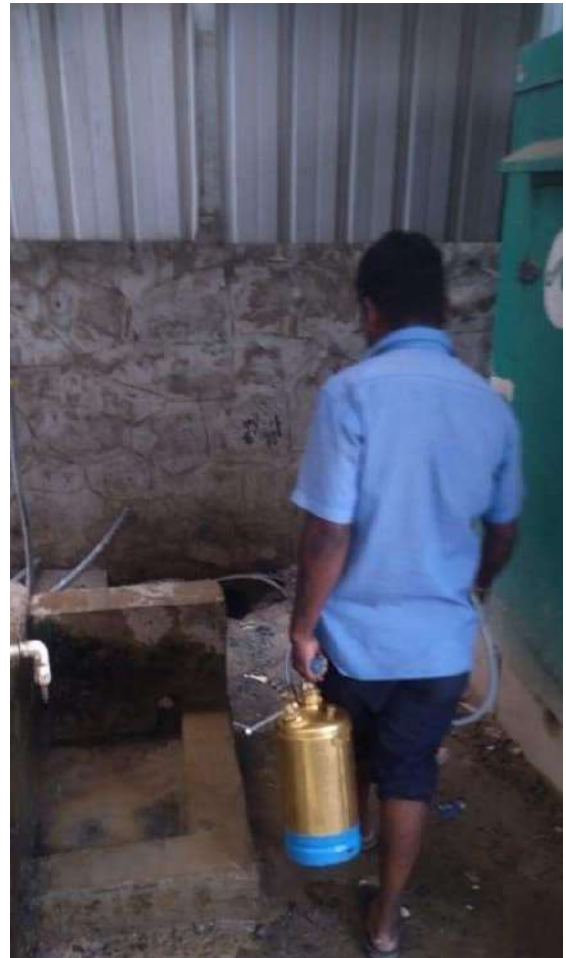
Sanitizing at Site