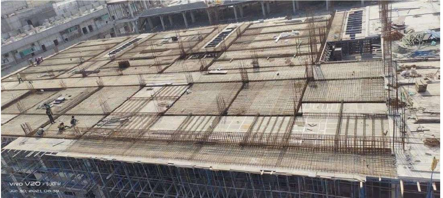
View of Medical College Roof