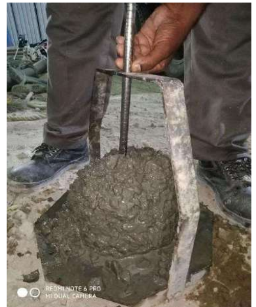
Slump Cone-in-situ Test