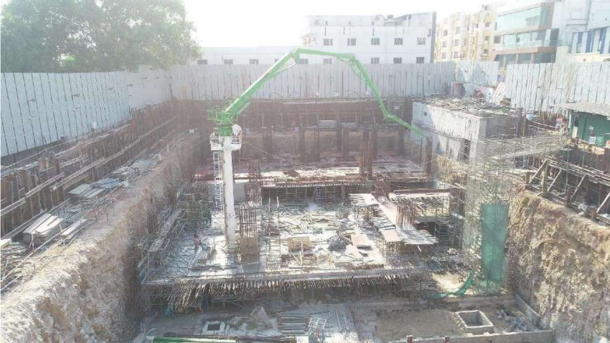
Unimix RM-1050 Mixer Machine