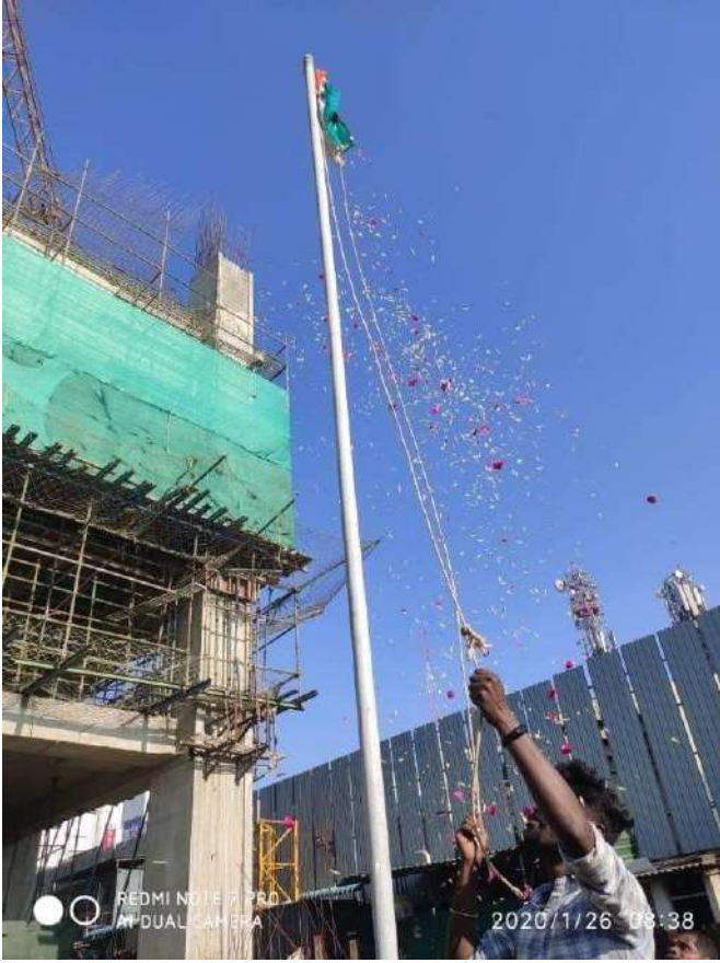
Flag Hoisting for Republic Day