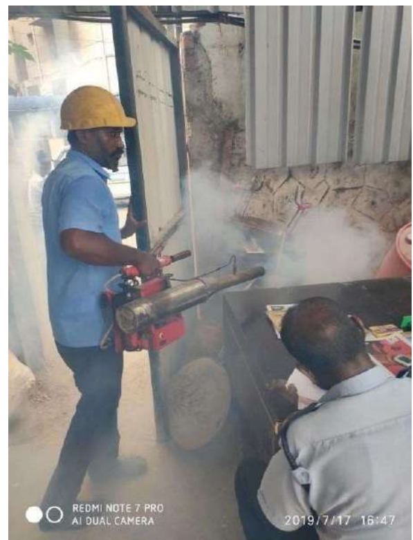
Periodic Pest Control Activity