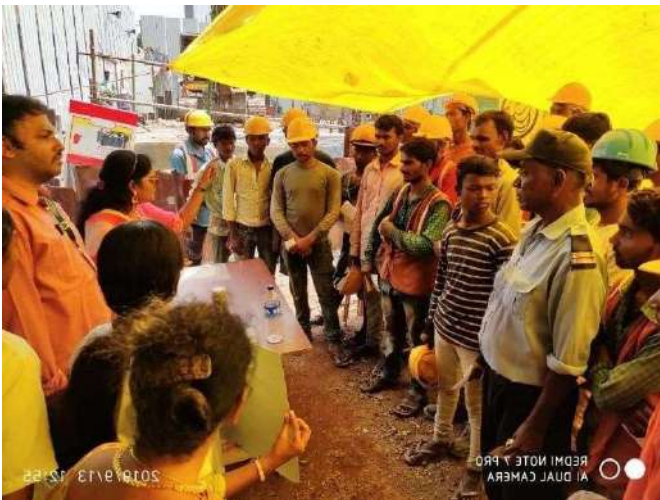
Awareness of Good Health & Avoid Plastic Use