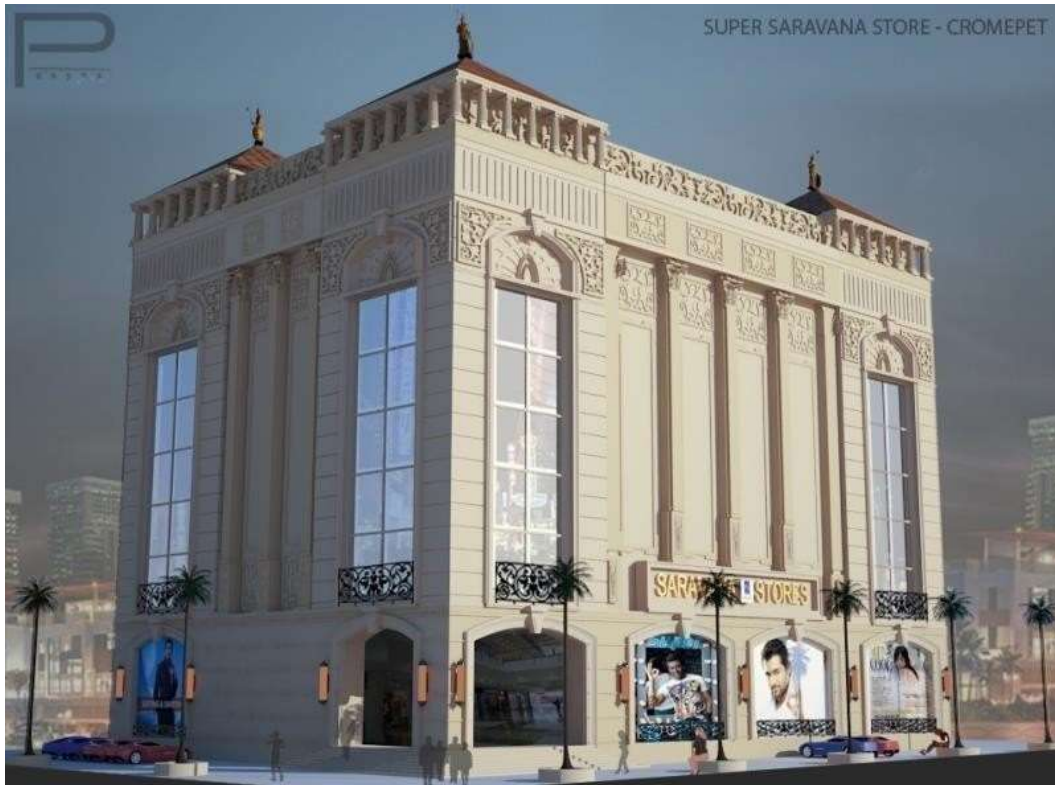
View of the building with European architectural civil works in the Elevation