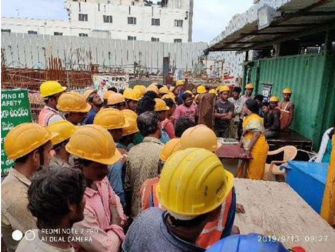
Health Awareness Speech to Workers