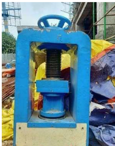
Universal Compression testing machine