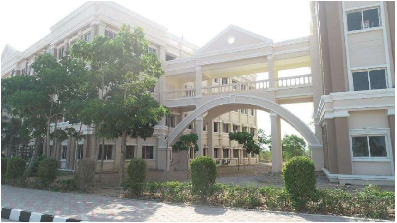
Sky-bridge connecting all academic block