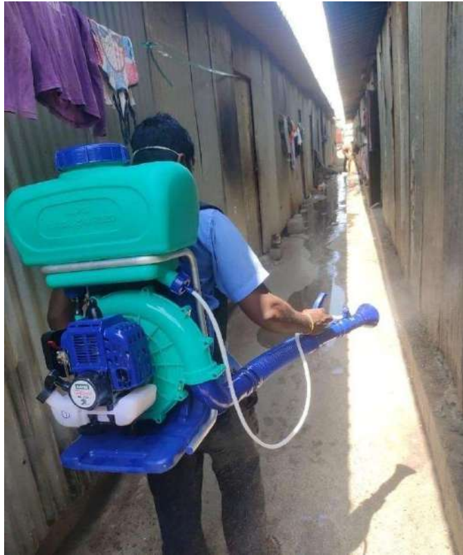
Sanitizing Labour Camp