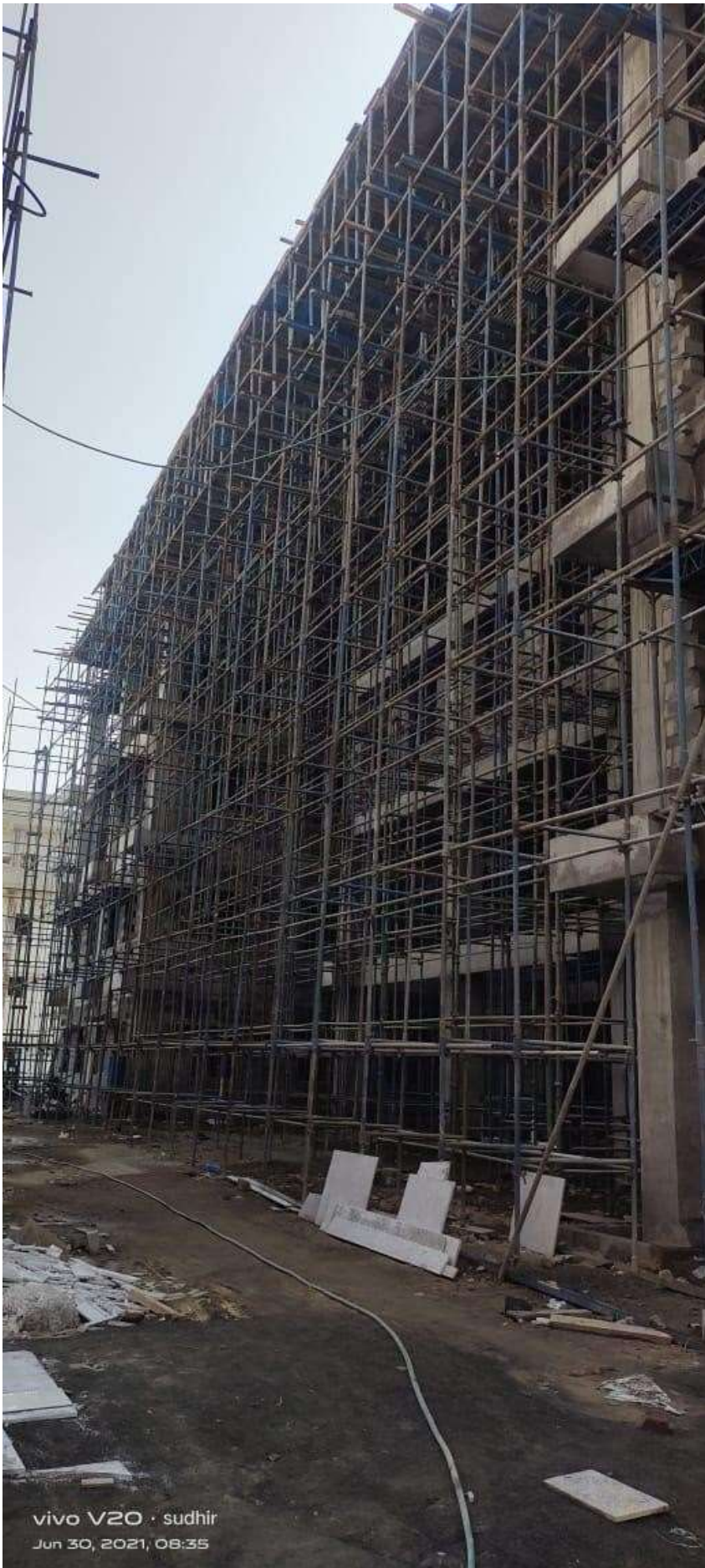
View of Medical College Elevation Scaffolding work