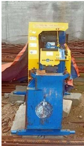
Steel Cutting Machine