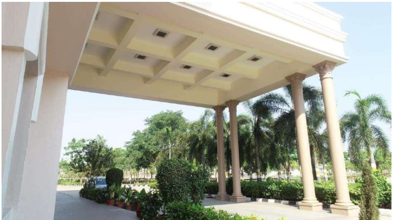
Academic Block Entrance Portico