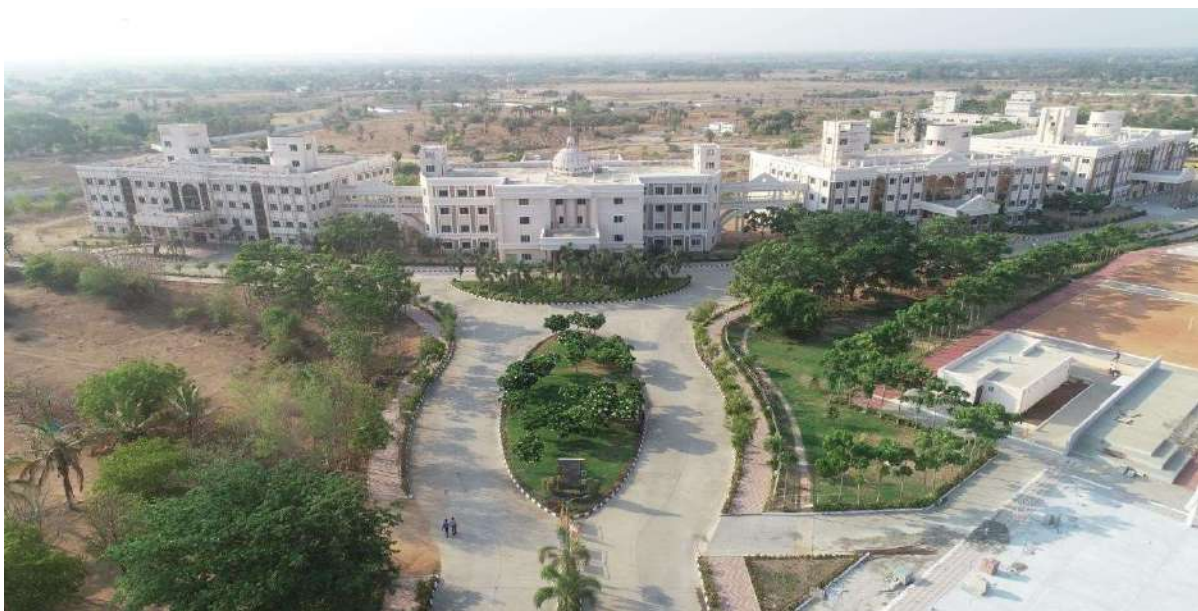
View of 4 Academic Blocks connected with Sky -bridge