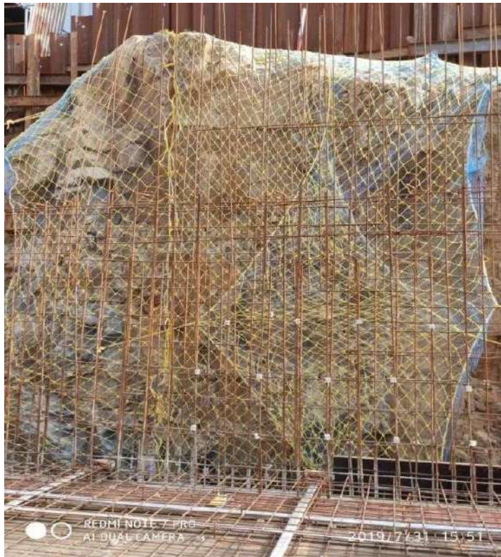
Safety Net Provided for Preventing Soil Collapse