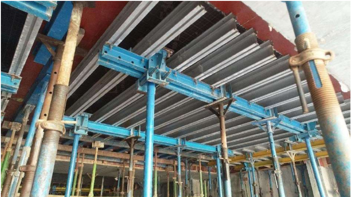
Table form work system