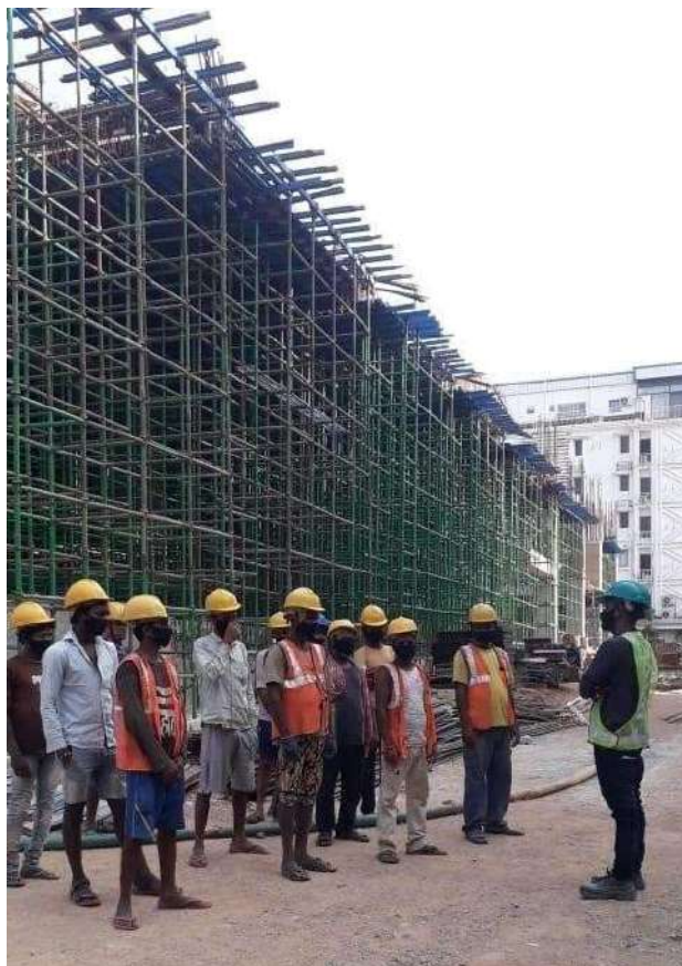
COVID-19 Awareness for Workers