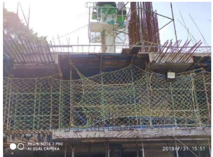
Safety Net for Work at Height