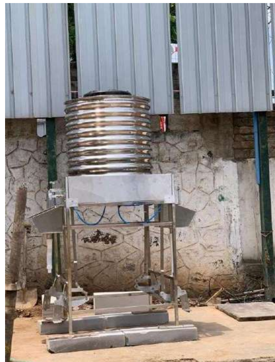
NO-TOUCH Handwash System