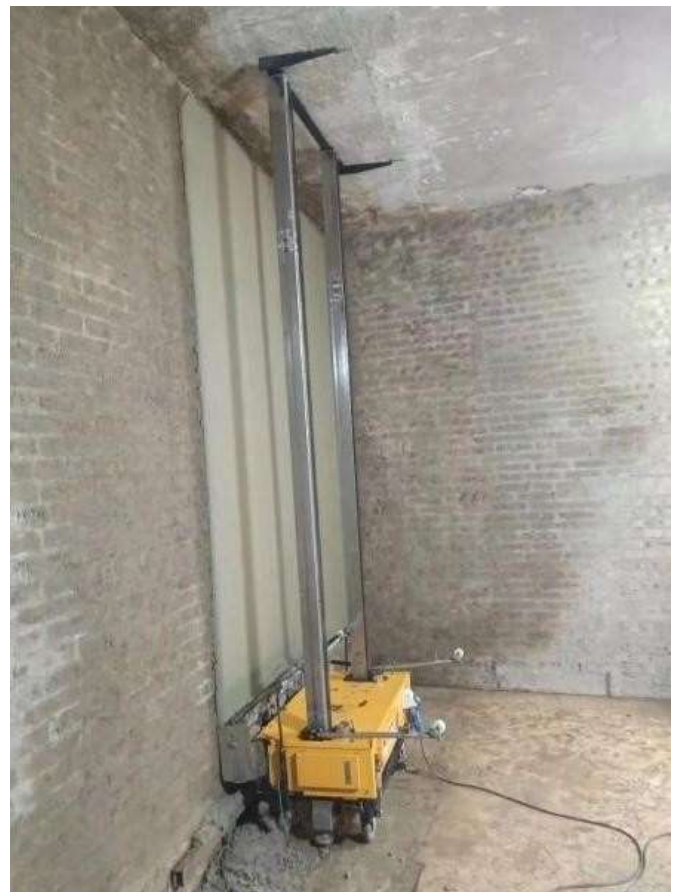
Wall Plastering Rendering Machine