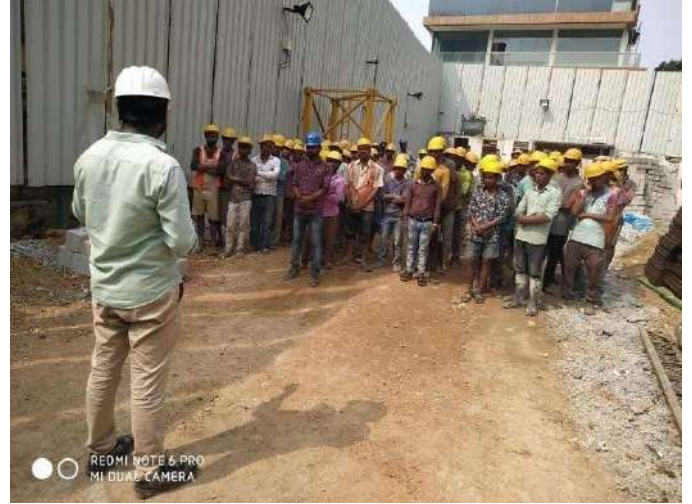
Safety Awareness Meeting on Safety Day