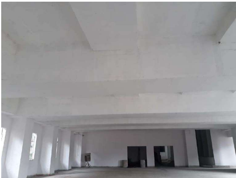
View of the Grand Hall, 19,810 Sq.ft double height ceiling