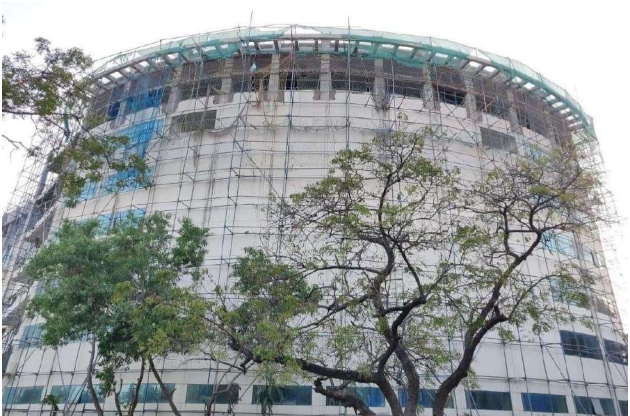
View of Jubilee Block- 6 th Floor Work in progress