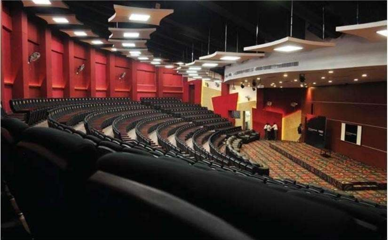
View of Lecture Hall with double height sloped ceiling