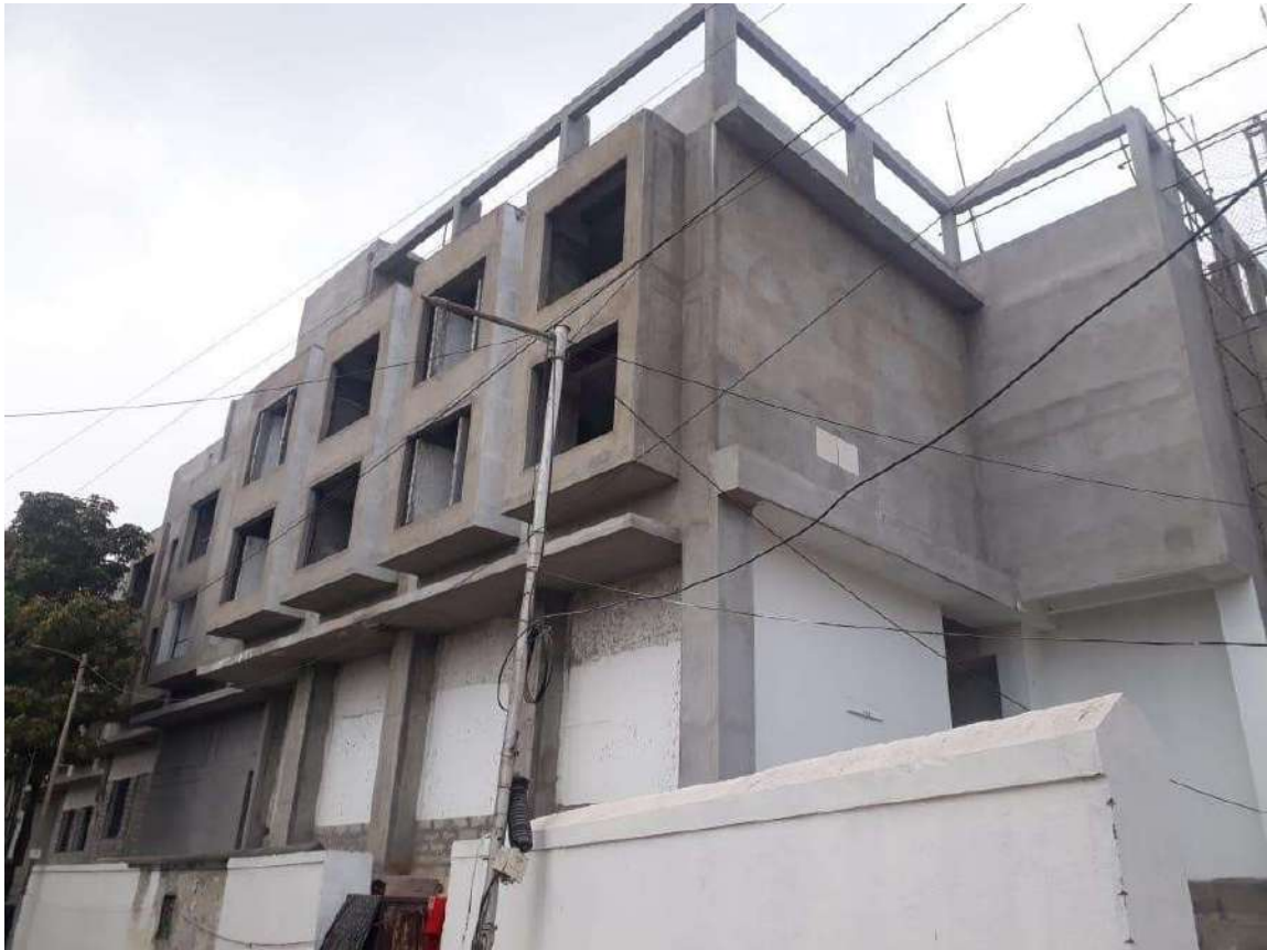
View of the Phase – 2 Block