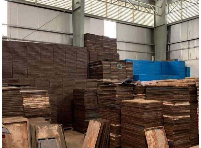
Centering sheet yard