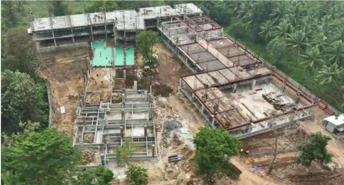
Top view showing the curvature of the 3 Academic blocks