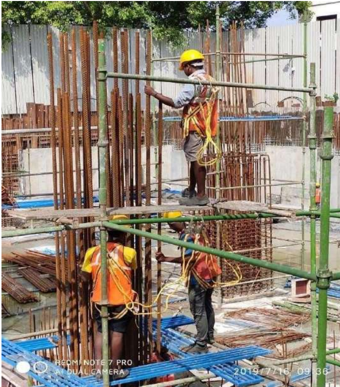
Full Body Safety Harness for all Protection