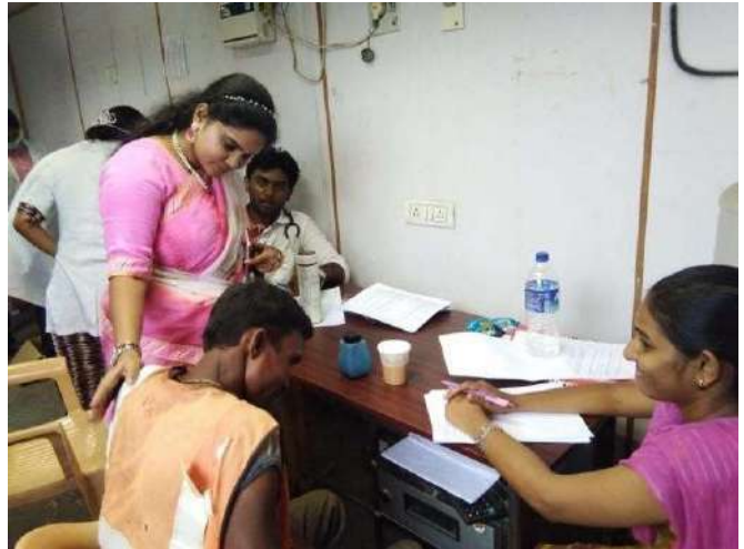
Health Checkup and Medicine Prescription