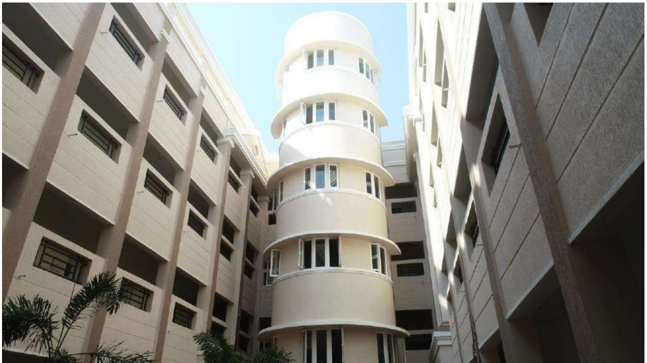
Inside view of academic block