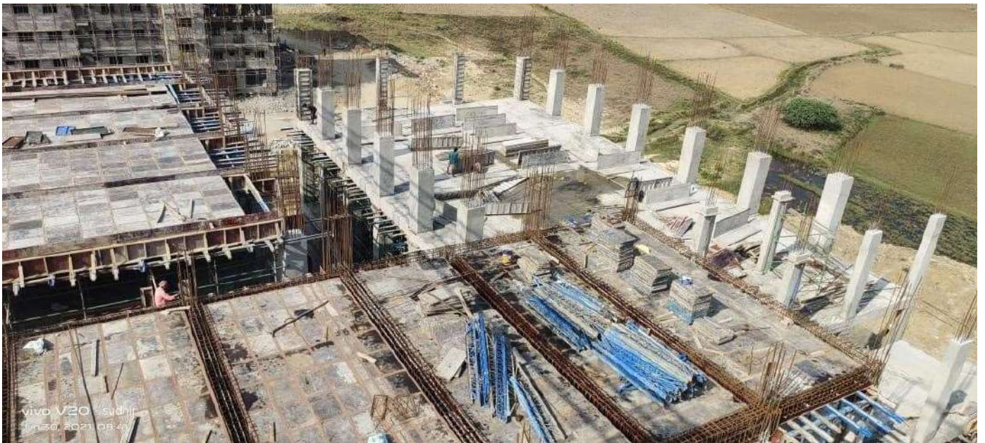
View of Lecture Theatre Block