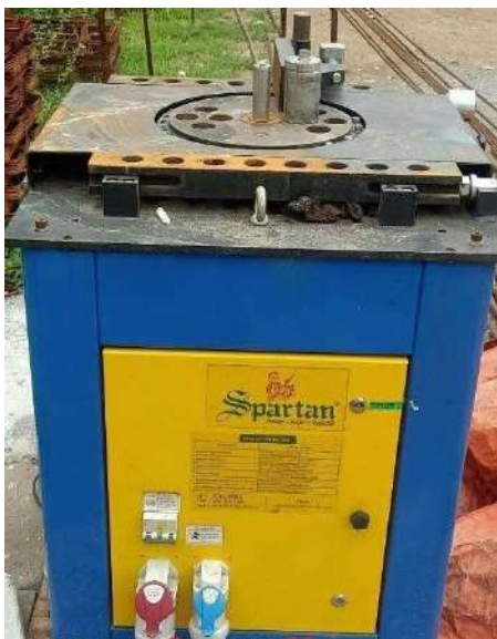
Steel bending machine