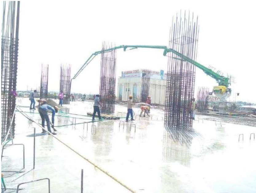
Wastage reduction upon using Boom Placer