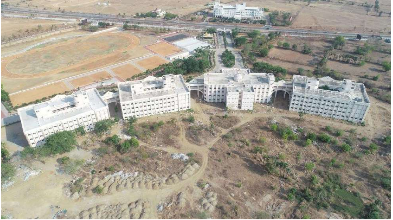
Back view showing the curvature of the 4Academic blocks