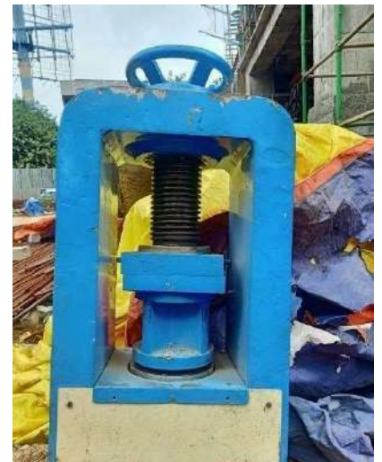
Compression testing machine